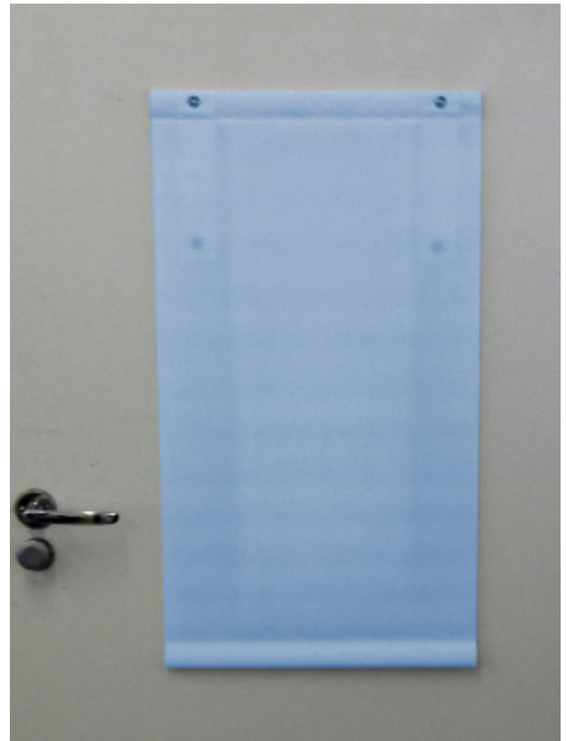
Door panel lowered